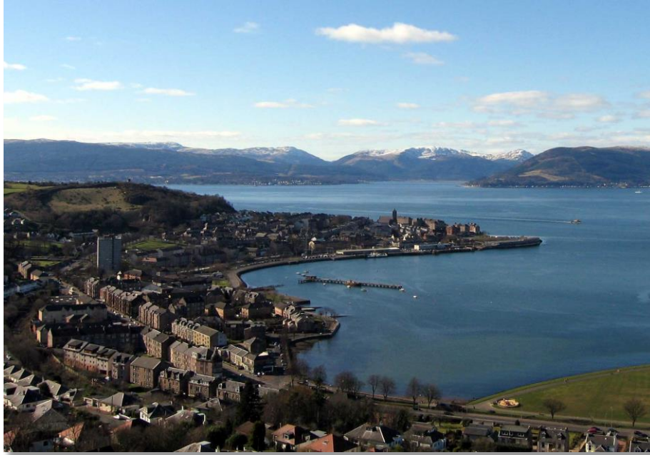
The Gourock pier is still visible in this recent photo. The train station where the airmen embarked for air bases in England can be seen at water's edge above and right of the pier.